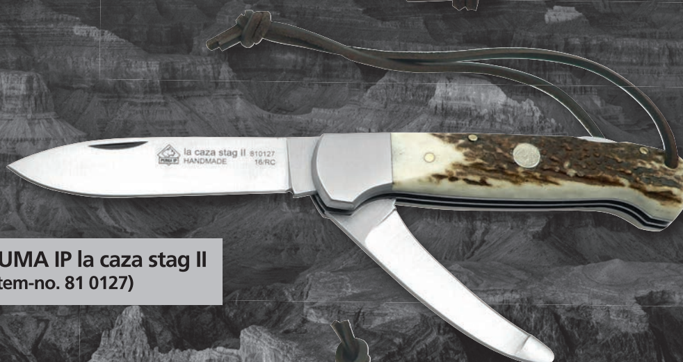
PUMA IP la caza stag II (item-no. 81 0127)