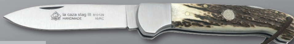
PUMA IP la caza stag III (item-no. 81 0129)