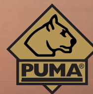
PUMA merlin (item-no. 11 7070)