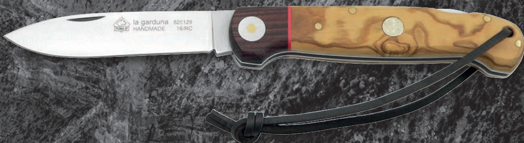
PUMA IP la garduna (item-no. 82 0129)