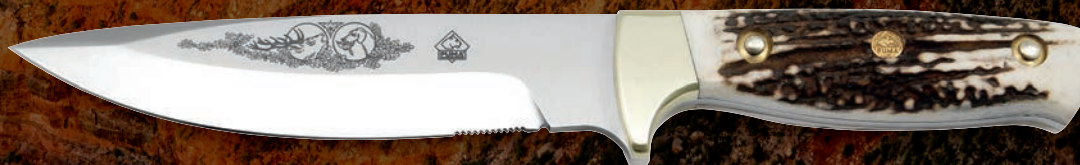
PUMA merlin series / backside / deep etch