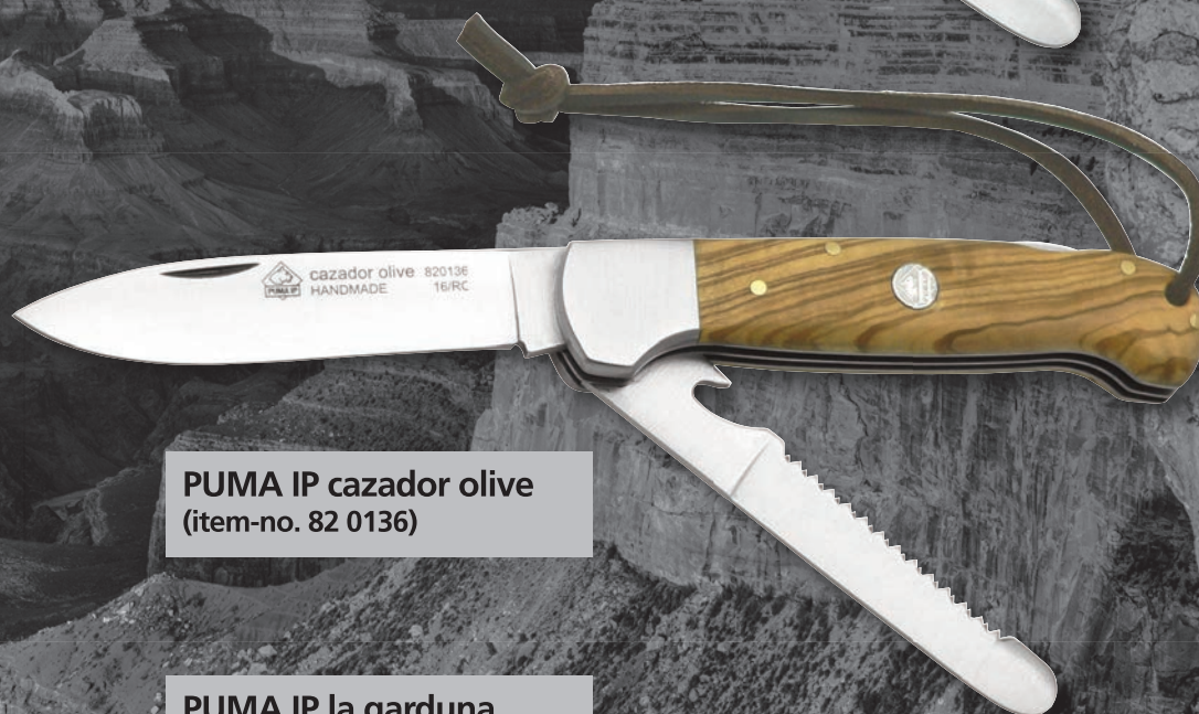
PUMA IP cazador olive (item-no. 82 0136)