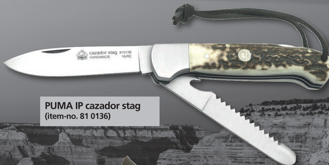
PUMA IP cazador stag (item-no. 81 0136)