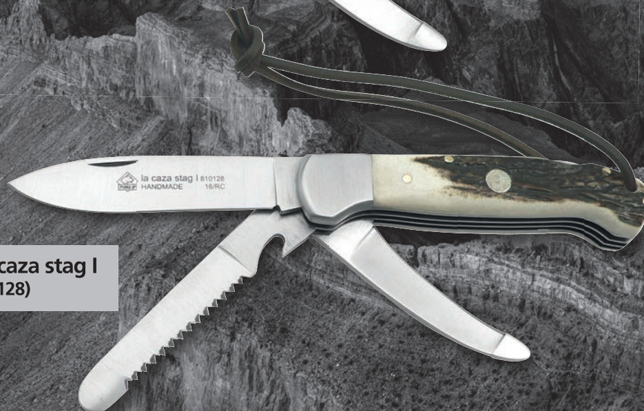
PUMA IP la caza stag I (item-no. 81 0128)